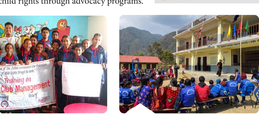
Child club management training ECA activities (Dance) Meghraj School

After the initial CFS project ended, the CFS-Follow Up Project (CFS-FSP or just CFS) was initiated in 2024 to maintain and expand on the achievements made in the schools. The CFS now mainly concentrates on improving the educational and developmental aspects in 12 schools (eight existing schools and four new schools). This includes training for headteachers and teachers, parental education, community engagement to create child-friendly environments, and offering extracurricular activities such as arts, drama, and sports. Additionally, the project aims to promote child rights through advocacy programs.