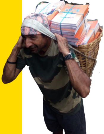
A porter carrying self-learning exercise book to deliver in school.