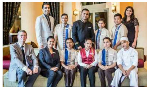
Our graduates after placement in Mövenpick IBN Battuta, Dubai

The graduates will be guaranteed a job placement following the successful completion of the training programme in Nepal and abroad. As the school has now come into operation, the second phase of the construction work has also started. Separate dormitories, an academic block, a banquet hall and a community house will be built in the second phase. More training courses will be added in the coming years as all the construction work is completed by 2019.