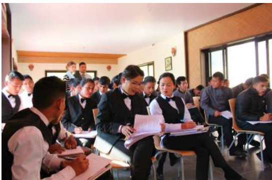
FAB School English class in action