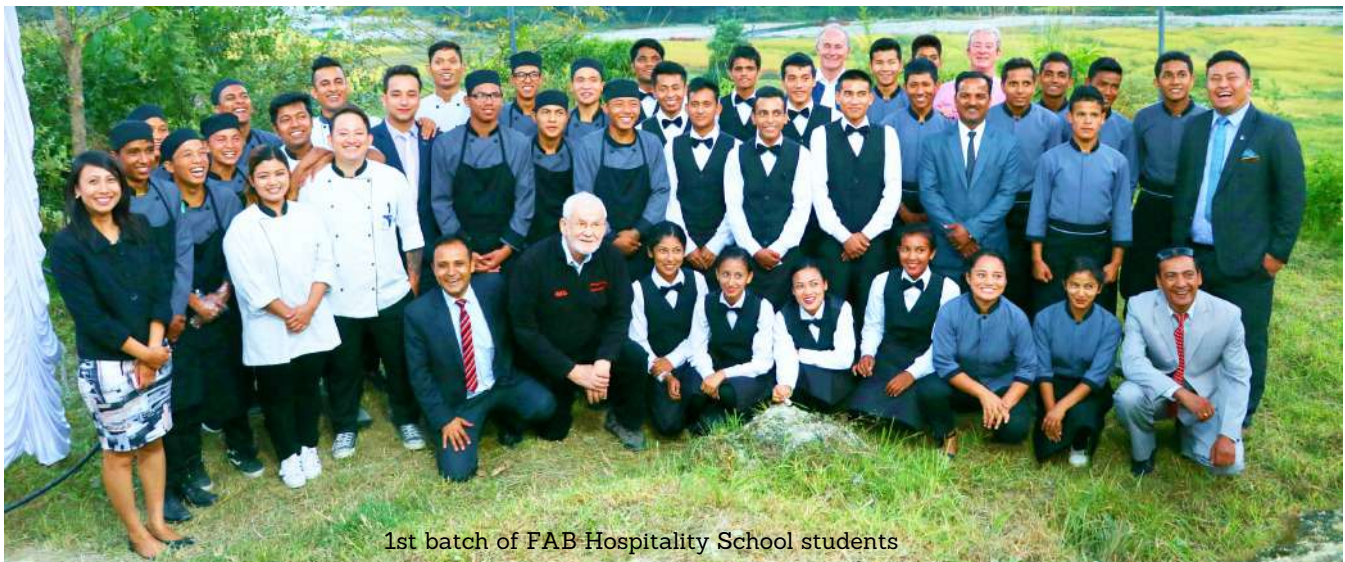
1st batch of FAB Hospitality School students