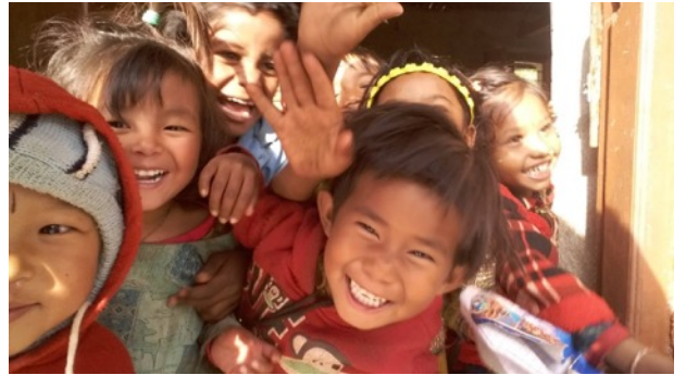
We are building schools for 1400 children in Marpak

The project has been approved by the National Reconstruction Authority and Department of Education and construction will start after the monsoon season. The project will take 2 years to complete