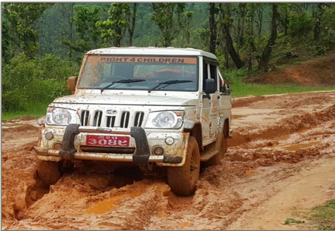
It's a 10 hour jeep ride up to Marpak including 4 hours on off-road which is not possible to pass