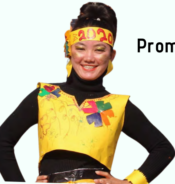
One of the Participants of trekking guide training