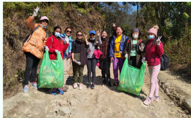
Trainees on cleaning campaign