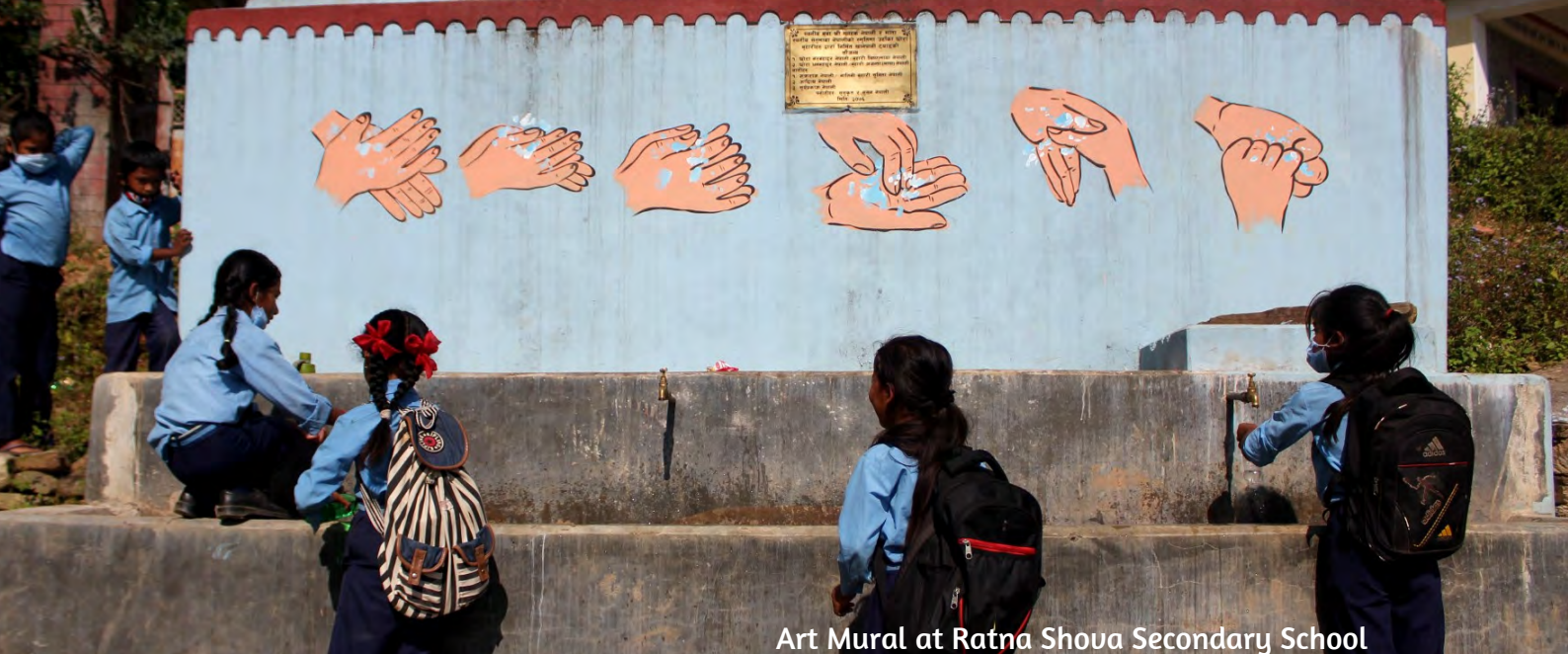
Art Mural at Ratna Shova Secondary School