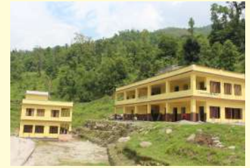
Mangaladevi Secondary School, RCC Structure, 2 Units, 16 Rooms, (297 Students)