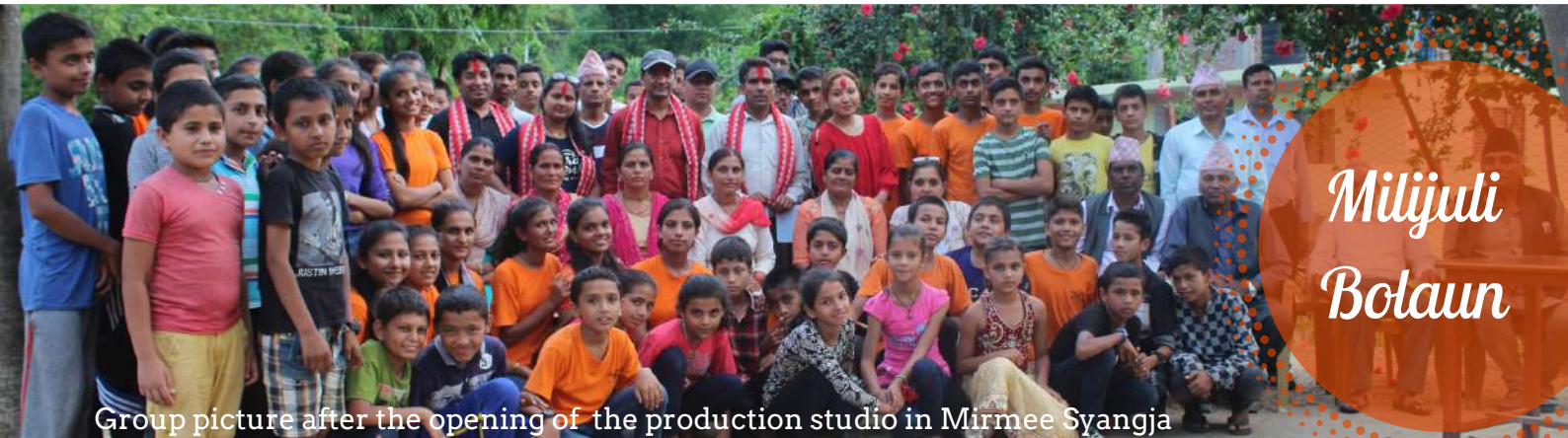
Group picture after the opening of the production studio in Mirmee Syangja

A child friendly modern toilet with sanitary facilities for girls and special facilities for persons with disabilities was built in Rudrepipal Secondary School, Baglung, with support from ONGD-FNEL, Luxembourg. The toilet was handed over to the school on the 20 th of April and is now being used by over 500 students and 25 teachers.