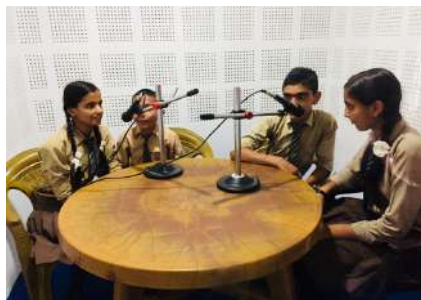
Milijuli Bolaun Recording Studio established in Mirmee Basic School, Syangja