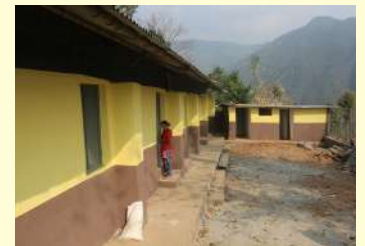
Janachahana Basic School renovated with additional Classroom, School Gate, fencing, (32 Students)