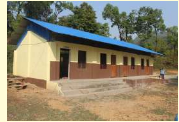
Marpak Pokhara Basic School, Truss Building, 2 Units, 7 Rooms (81 Students)