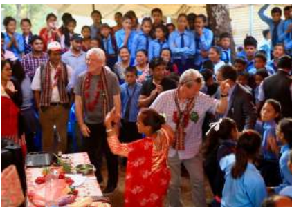
Marpak Special : Opening of the Reconstructed schools in Marpak