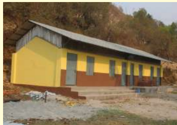
Janabhawana Basic School renovated with added facilities such as School Gate, Fencing, Toilet and Community Water Tank, (35 Students)