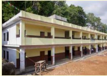
Niranajana Secondary School, RCC Structure, 2 Units, 12 Rooms (509 Students)