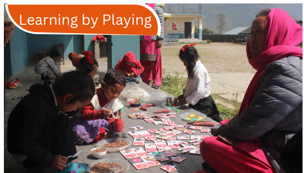
Learning by Playing

From January to August 2025, the SUCCESS project by Right4Children advanced health, education, sanitation, and livelihoods for vulnerable communities. Ten reproductive health camps in Wards 1, 2, 9, 14, 15, 18, 19, 24, 25, reached 415 women, while 158 children in nine ECD centers received daily nutritious meals, improving growth and attendance.