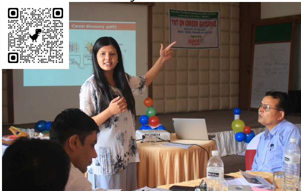
Career Guidance ToT for Focal Teachers