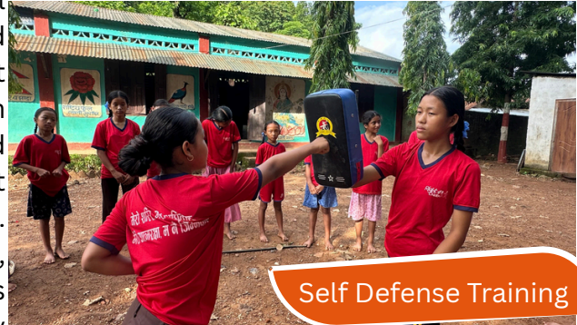
Self Defense Training

Started in January 2024, the School Improvement for Quality Assurance and Enhancement in Education (SIQAEE) Project by Right4Children aims to enhance education in community schools of Hupsekot and Baudikali in Nawalpur District in direct partnership with respective local government. The project improves school infrastructure, provides classroom furniture, and upgrades WASH facilities to create safe, child-friendly environments.