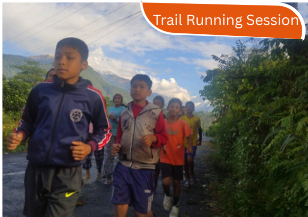
Trail Running Session

In the first half of 2025, the Child Friendly School Follow-Up Project advanced across 12 schools in Machhapuchhre Rural Municipality, overcoming challenges like teacher strikes. Strategic meetings with school leaders and municipal staff strengthened governance, while teaching materials reached 38 schools, benefiting 400 teachers and 3,633 students. Child Clubs were reactivated in six schools, and the SEE pass rate rose from 56.4% to 84.4%, the highest in Kaski. Hands-on ECD sessions introduced active learning using local materials, reflecting a shared commitment to inclusive, child-friendly schools.