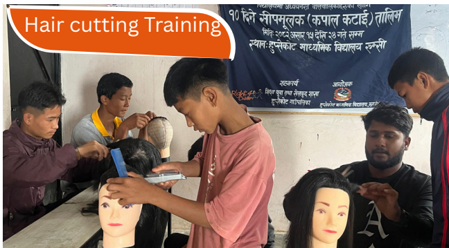
Hair cutting Training

It strengthens teaching through teacher training, remedial classes, and childs clubs. SIQAEE also supports holistic development through extracurricular and life skills activities. Parental engagement is promoted via awareness sessions and home visits. By connecting schools, families, and communities, the project fosters a supportive and inclusive learning environment for children to thrive.